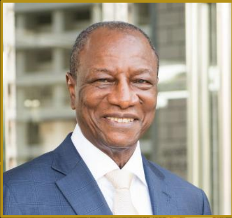
HEM the President of the Republic of Guinea, Professor Alpha Condé

The event is organized by the Private Investment Promotion Agency (APIP-Guinea) in collaboration with the African Development Bank (ADB) and the World Bank through its subsidiary the International Finance Corporation.